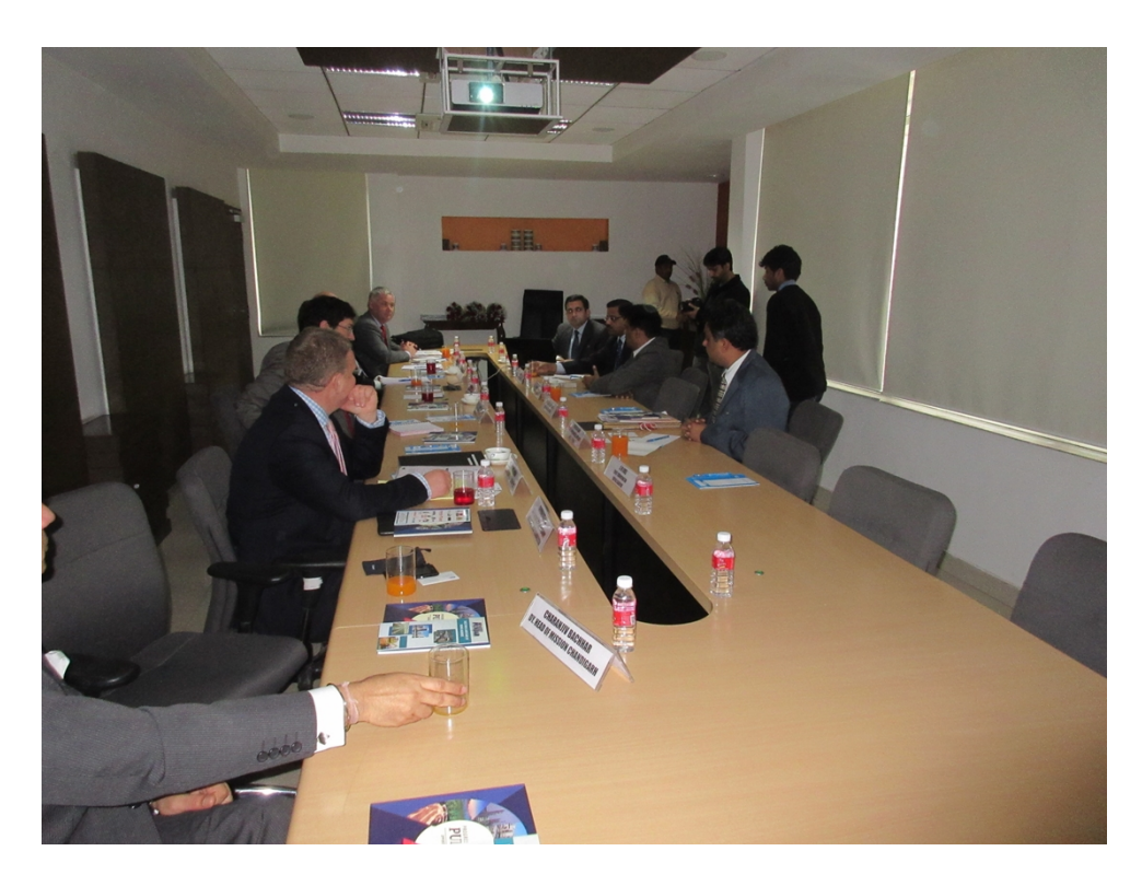
Conference with Confederation of Indian Industry (CII)